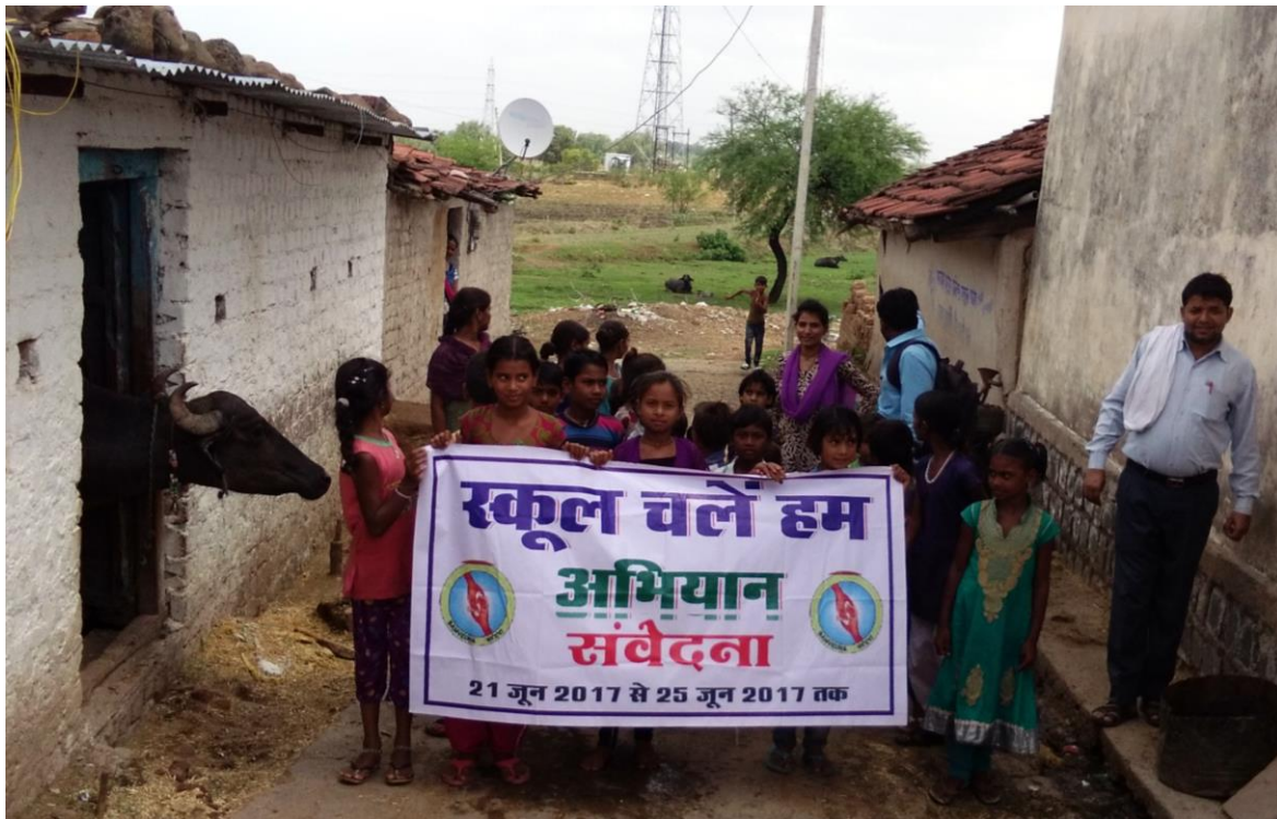
Education Drive Rally in Kolukhedi