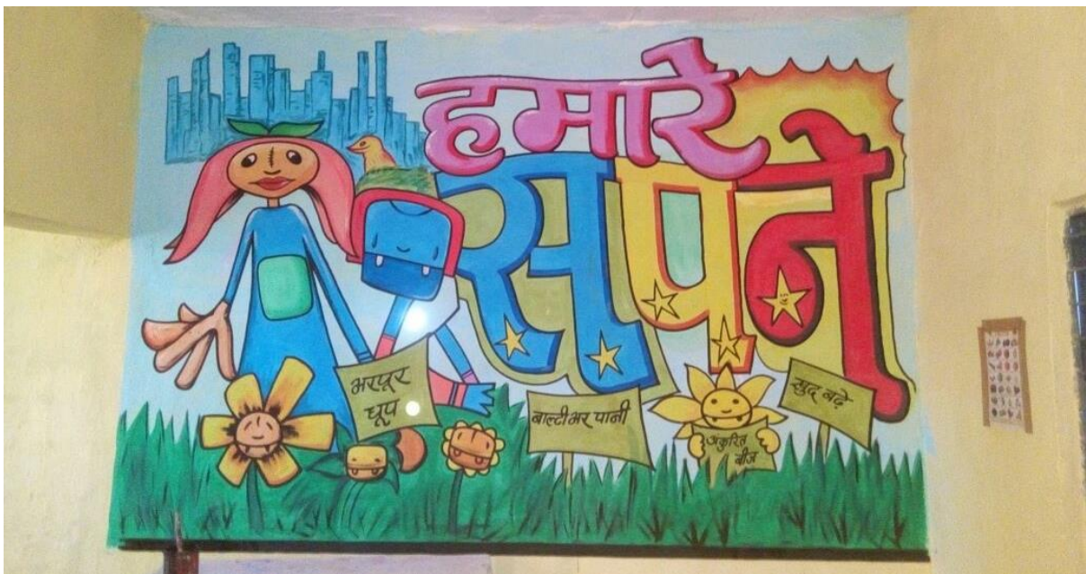
Kolukhedi Primary School

2 murals painted to create an upbeat and vibrant environment for children!