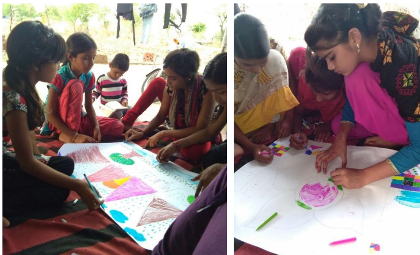
Children's Groups' activities in progress

After the successful completion of TIE 2017, children's groups were formed in our project villages. Children's group can be seen as an extension of CRC and our Education Aid classes. These groups function independently with the assistance of their Educator in the village. We now have an actively functioning children's group in 3 of our villages, where they not only participate in the activities organized by Samvedna, but also initiate work for the benefit of their own community.