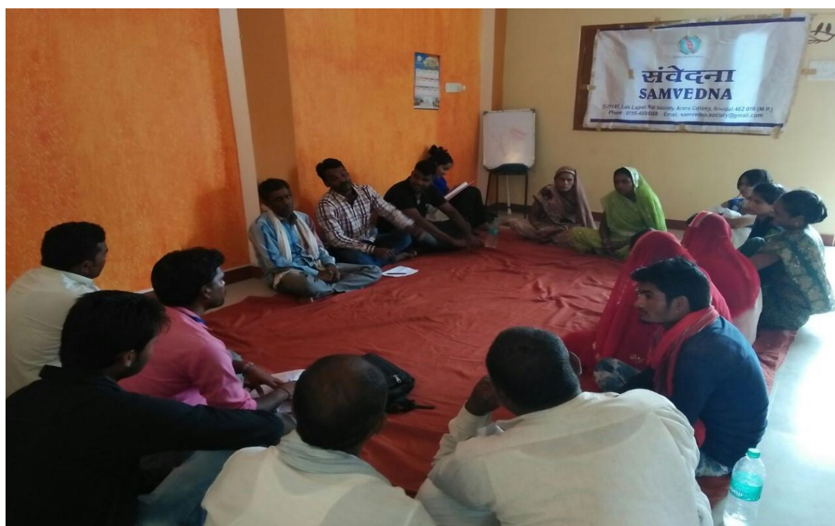
Community meeting in progress in Samvedna’s Narsingarh Field Office

Samvedna organized a community meeting in its Narsingarh field office where members of different communities participated. The objective was to understand the communities’ perception of our work and to set mutual future goals. This was also a preparatory meeting in anticipation of the Gram Sabha that was to be shortly held. Issues pertaining to their respective villages were discussed and all were encouraged to be an active part of the Gram Sabha.